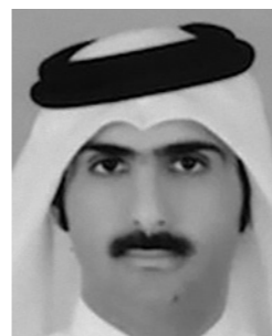
H.E. Sheikh Abdulrahman bin Hamad bin Jassim bin Hamad Al-Thani Qatar's Minister of Culture