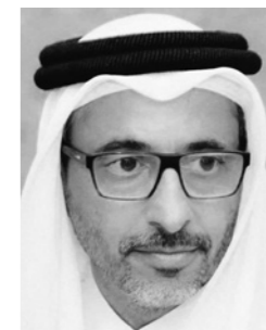
H.E. Salah bin Ghanem Al Ali Qatar's Minister of Youth and Sports