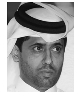
H.E. Nasser bin Ghanem Abdullah Al-Khelaifi Chairman of beIN Media Group