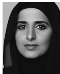
H.E. Sheikha Al Mayassa bint Hamad bin Khalifa Al-Thani Founder and Chairperson of Doha Film Institute