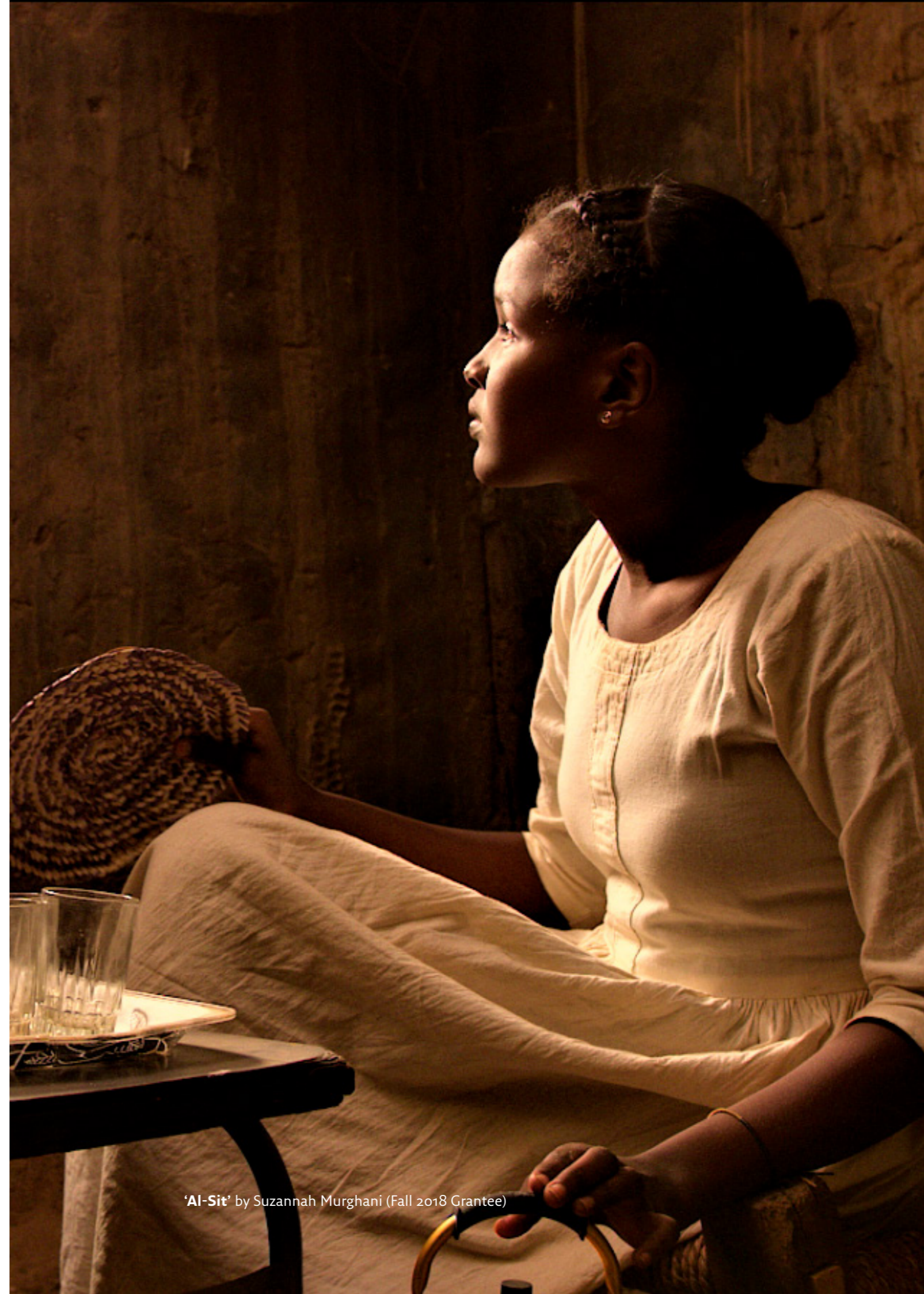
'Al-Sit' by Suzannah Murghani (Fall 2018 Grantee)

Development: up to $5,000 Production/Post-Production: up to $10,000