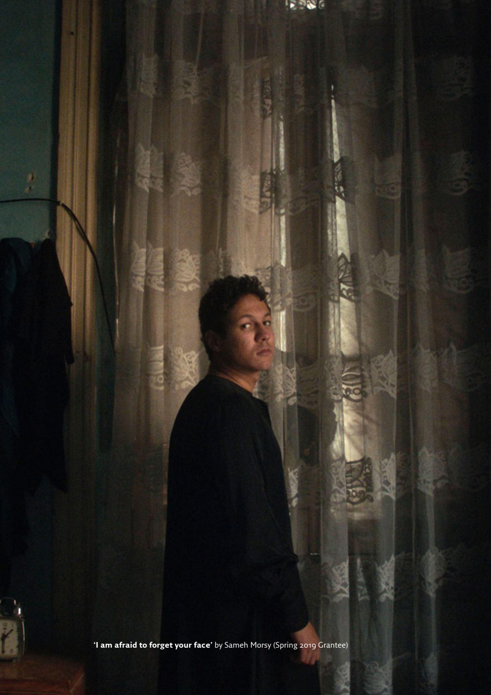
'I am afraid to forget your face' by Sameh Morsy (Spring 2019 Grantee)